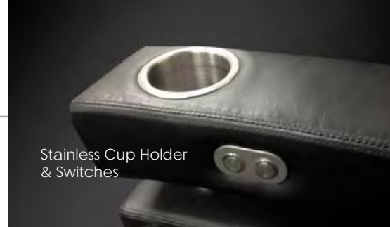
Stainless Cup Holder & Switches