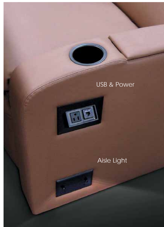
USB & Power