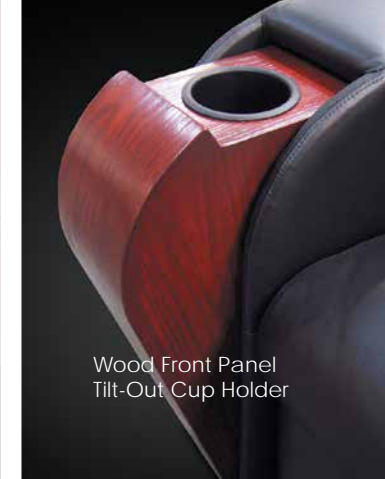
Wood Front Panel Tilt-Out Cup Holder