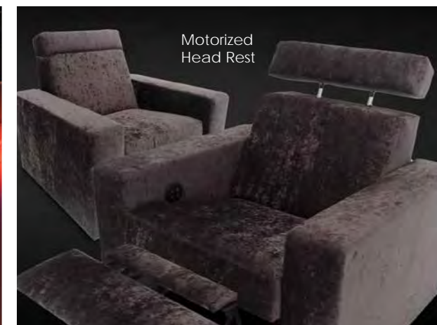
Motorized Head Rest