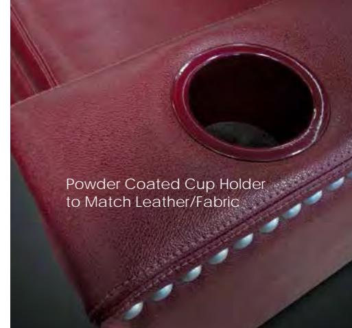
Powder Coated Cup Holder to Match Leather/Fabric