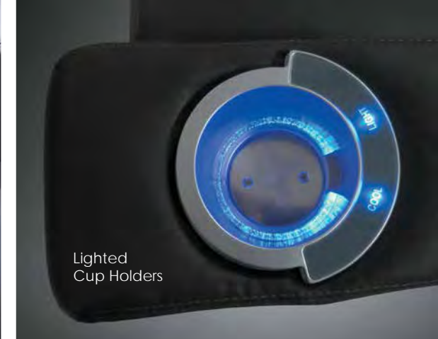
Lighted Cup Holders