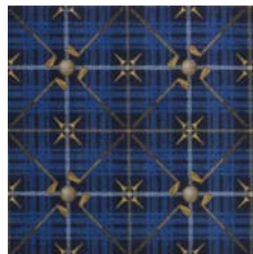
03 Seaside Blue