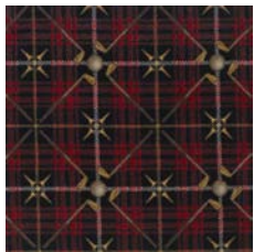
01 Lumberjack Red