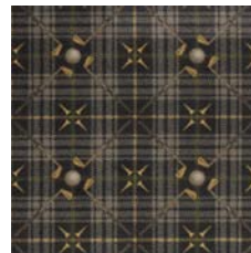
04 Dark Brown